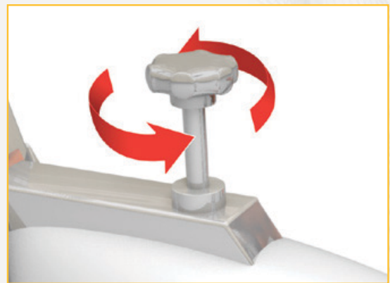
Adjustable Resistance Knob