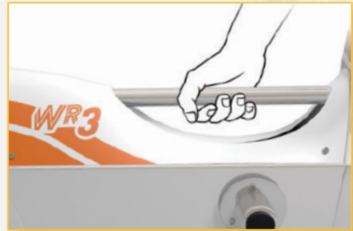
Integrated Carry Handle